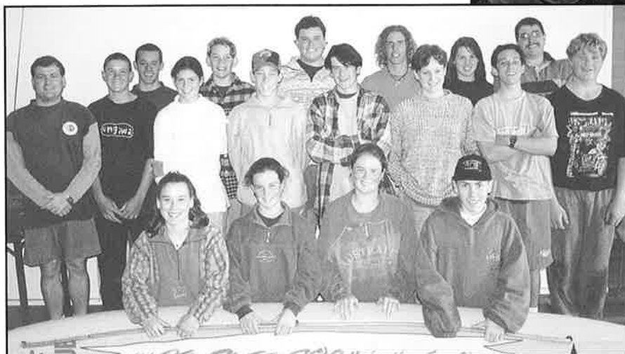
LEFT: The 1996 Bronze and SLSC Squads