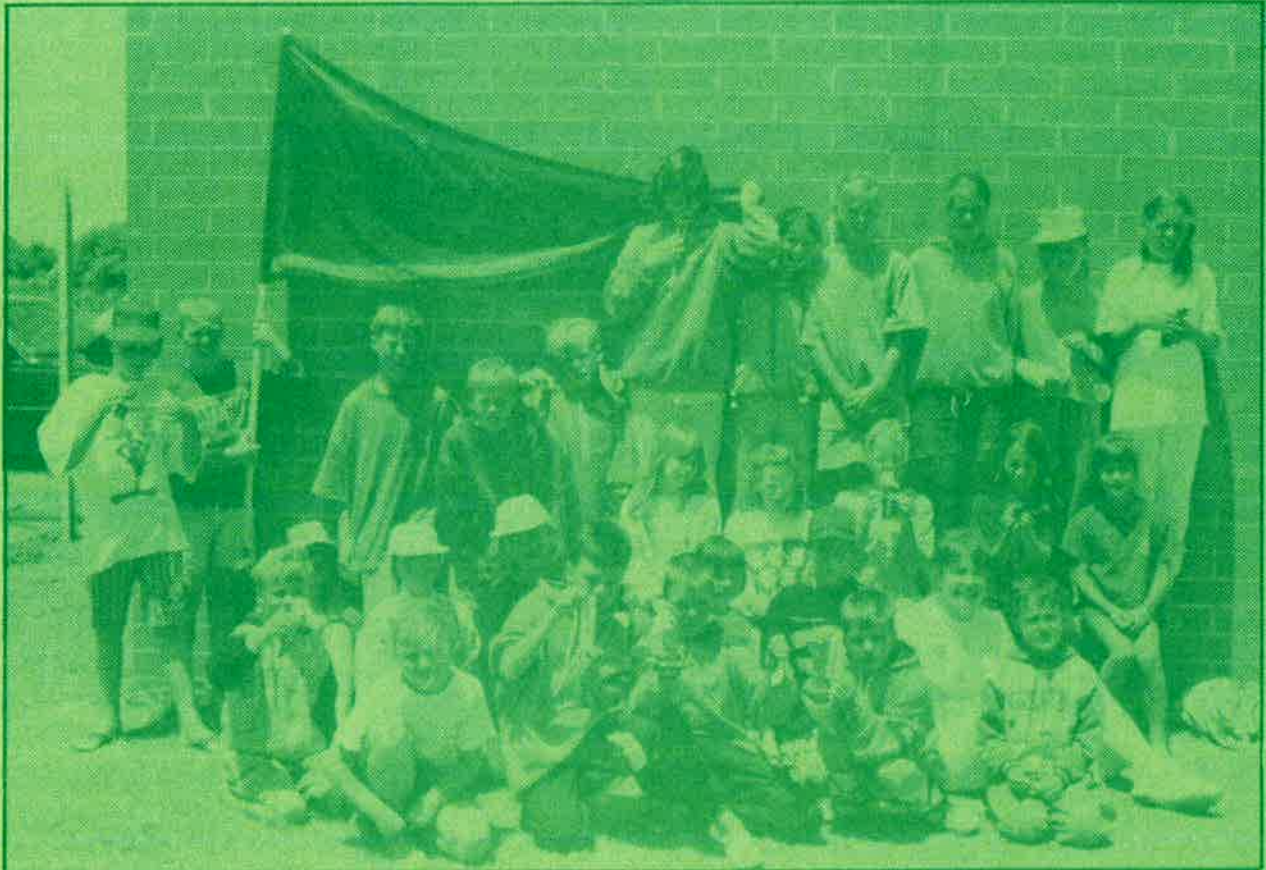
The Cape Paterson S.L.S.C. Nipper Team Winners of the 1993 Eastern Zone Carnival.