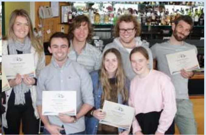
100+ Patrol Hours